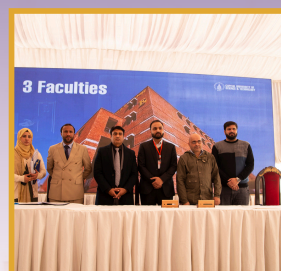
NextGen Corporate Summit 2023

CSO effectively categorized students into three primary groups based on their career aspirations. Firstly, for those seeking employment, companies were specifically invited for hiring purposes. Secondly, for aspiring entrepreneurs, Incubation Centres were present to provide guidance and support. Lastly, for students interested in foreign education, education consultants were invited, emphasizing a holistic approach to career development.